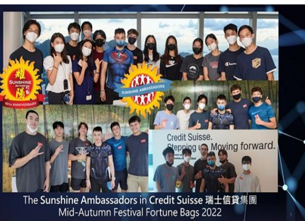
The Sunshine Ambassadors in Credit Suisse 瑞士信貸集團 Mid-Autumn Festival Fortune Bags 2022